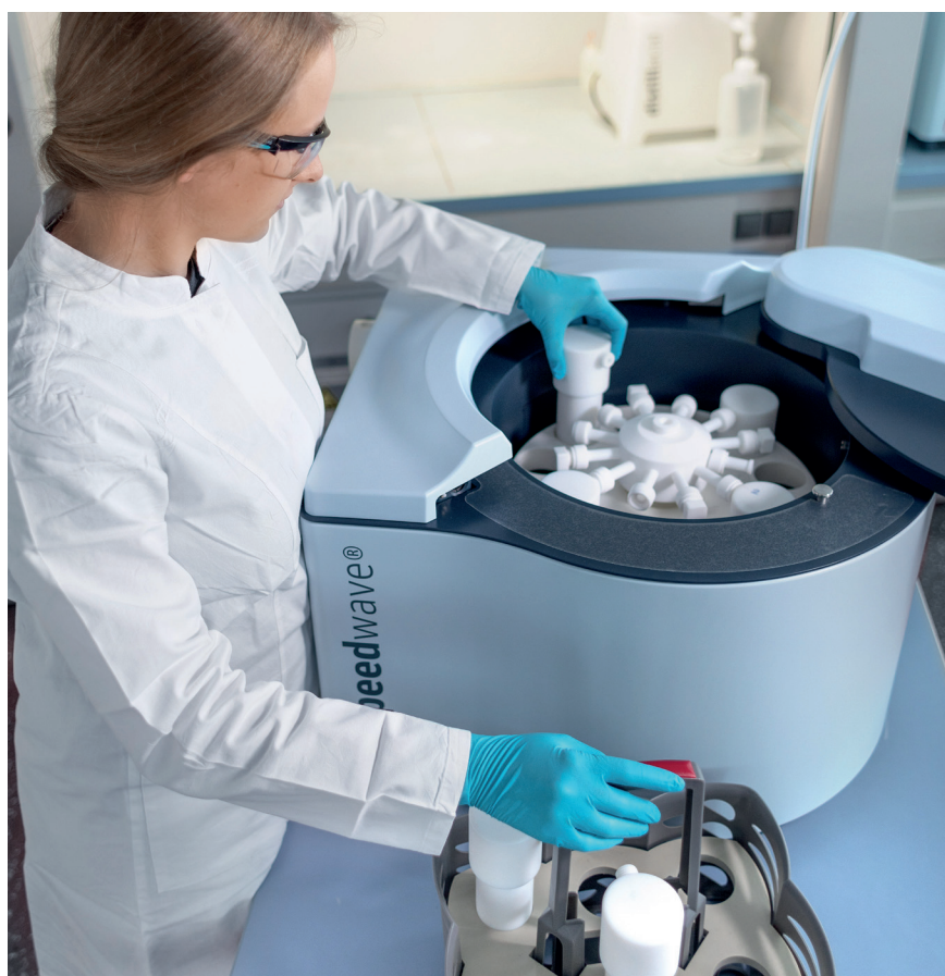
Overview vessel options

Additional liner systems expand the field of applications of existing vessel types. The vessels can be equipped with inserts to support digestion of small sample quantities or complex samples.