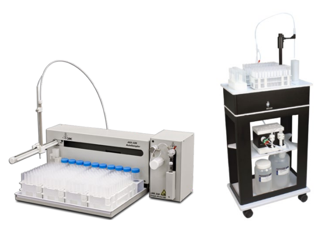
The Cetac Technologies 'SDS-550' and Elemental Scientific 'prepFAST', Offline Sample Dilution Systems

Offline dilution systems are programmable dilution systems that automate the preparation of calibration standards and samples prior to analysis by ICP-MS. Using a purpose-built software platform, method programs are developed for preparing sample batches, instructing the sampler and auto-dilution system on the volume of sample to be collected, the location of the awaiting dilution tube, which reagents to mix and the final dilution volume required for each sample. The preparation of calibration standards from bulk standards and the addition of internal standard to each solution are also possible. Preparation work is typically done offline with a dedicated PC and without being directly connected to the ICP-MS. Labor intensive sample preparation is greatly reduced for routine applications without sacrificing accuracy and precision, requiring only the transfer of prepared solution racks to the ICP-MS autosampler for analysis.