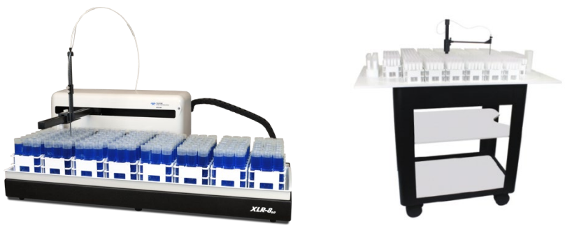
High capacity autosamplers from Cetac Technologies and Elemental Scientific