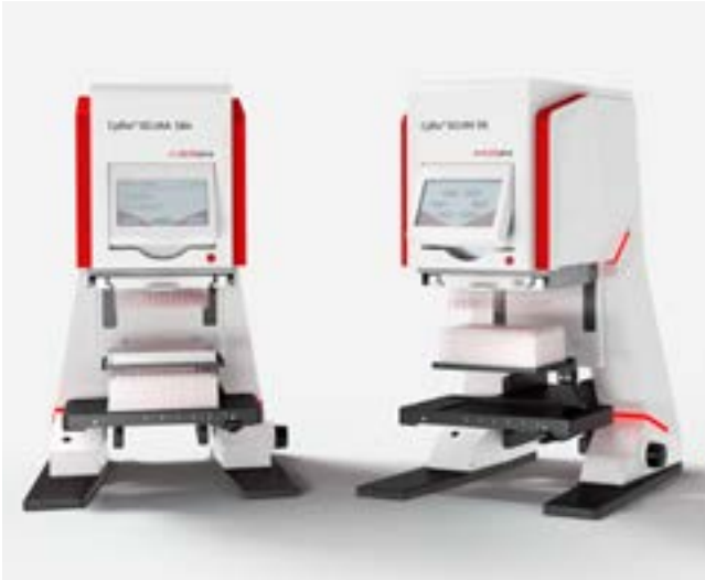
CyBio SELMA 96 and 384