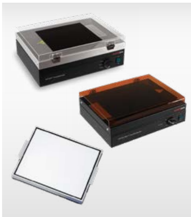
UV and blue light transilluminators, UV-to-white converter plate