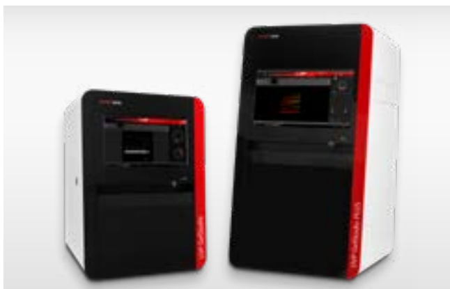
UVP GelStudio imaging systems