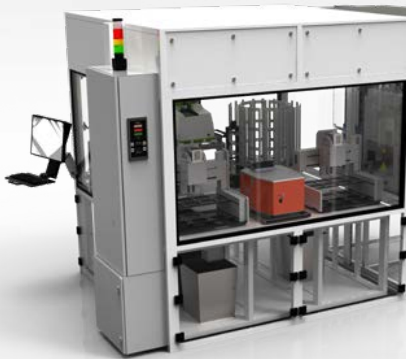
Fully automated system CyBio Automation