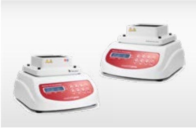
Biometra TSC ThermoShaker and Biometra TS1 ThermoShaker

Thermal mixers belong to the basic equipment of most laboratories. Established thermal mixers are models TS1 (heating up 100 °C) and TSC (as TS1 plus cooling till ambient minus 15 °C). They can be used as pure shaker, as dry-block thermostat and as thermal shaker. They ensure reliable incubation parameters with a stable temperature maintenance over the complete sample block. The set mixing speed is quickly reached.