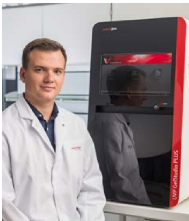
Integrated multi-touch computer

The software allows for creating custom icons and workflows based on users' needs. The UVP GelStudio guarantees top image quality and an optimized range of high performance features. With its high resolution camera, high dynamics and excitation ranges from 400 to 800 nm, this series introduces a new benchmark that goes far beyond publication-quality images.