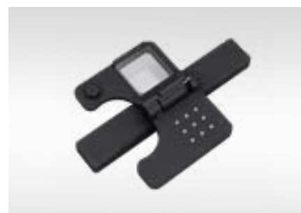
Standard Cuvette Adapter, CHIPCUVETTE Adapter, and Butterfly Cuvette