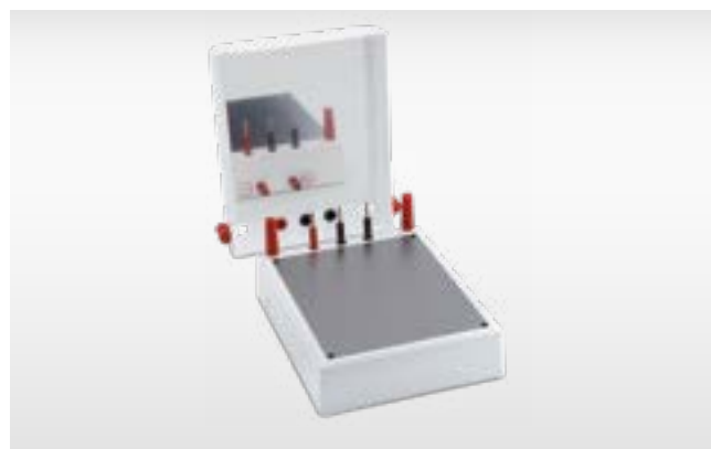
Biometra Fastblot B43 and B44