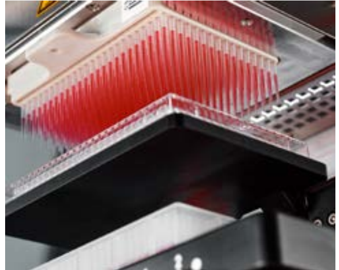
CyBio SELMA consists of 96 or 384 pipetting channels which enable a safe and error-free transfer