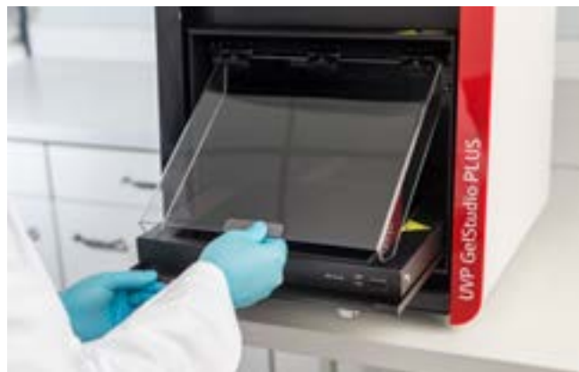
UV Protection Shield