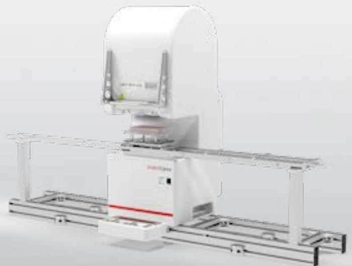
CyBio Well vario