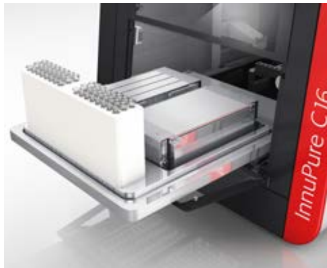
Intelligent kit architecture

InnuPure C16 touch combines highly precise liquid handling with automated extraction. Thanks to its walk-away principle, all you have to do is load the samples. After initial start-up, the entire process is fully automated. Ready-to-use Reagent Strips and/or Plates make pipetting errors a thing of the past, while 1 mL pipette tips with aerosol filters prevent contamination of the dispensing unit and samples. Economic non-filled Kits for manual prefilling are available, too.