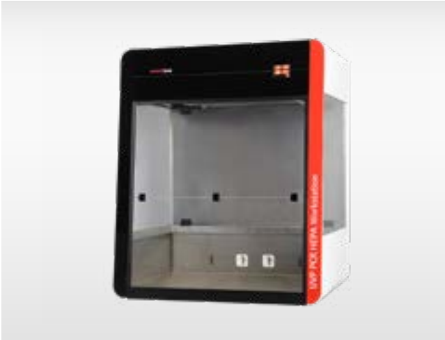
UVP PCR HEPA Workstation

Analytik Jena offers a complete line of PCR UV hoods. These products bring together UV irradiation and antimicrobial stainless steel and aluminum to create a dual-attack environment against PCR contaminations. The latest addition to this product line are the powerful new UVP PCR Workstations. These Workstations are designed for placement of large instruments on the work area or small items on the removable shelves. They can be configured with or without a HEPA filter assembly based on customer needs. These systems have been specially designed to enable unbelievably easy assembly and service.