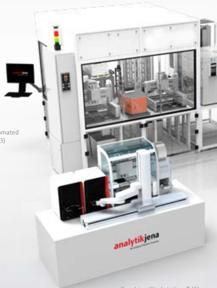
Fully Automated Systems (3)