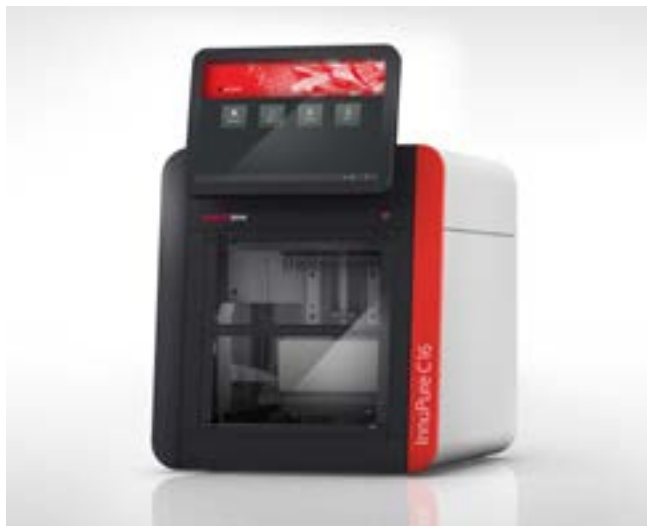
InnuPure C16 touch