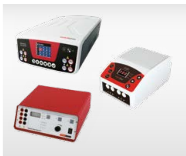
Biometra PS 307TP, Biometra P25T and Biometra PS 300TP