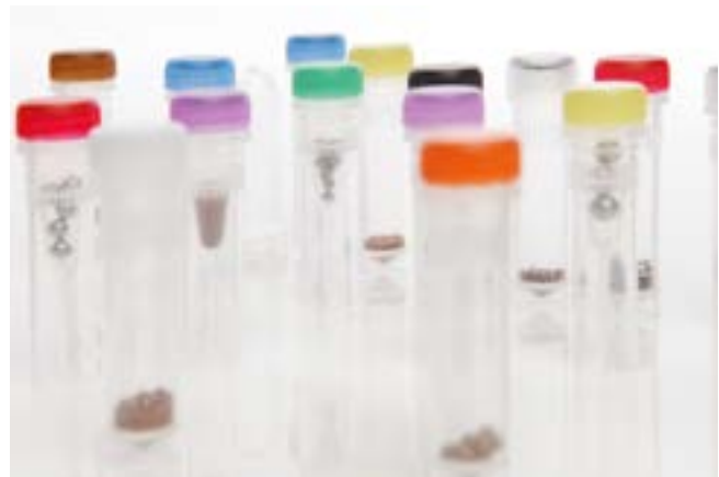
innuSPEED Lysis Tubes