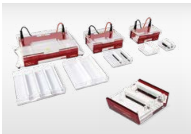
Biometra Compact family