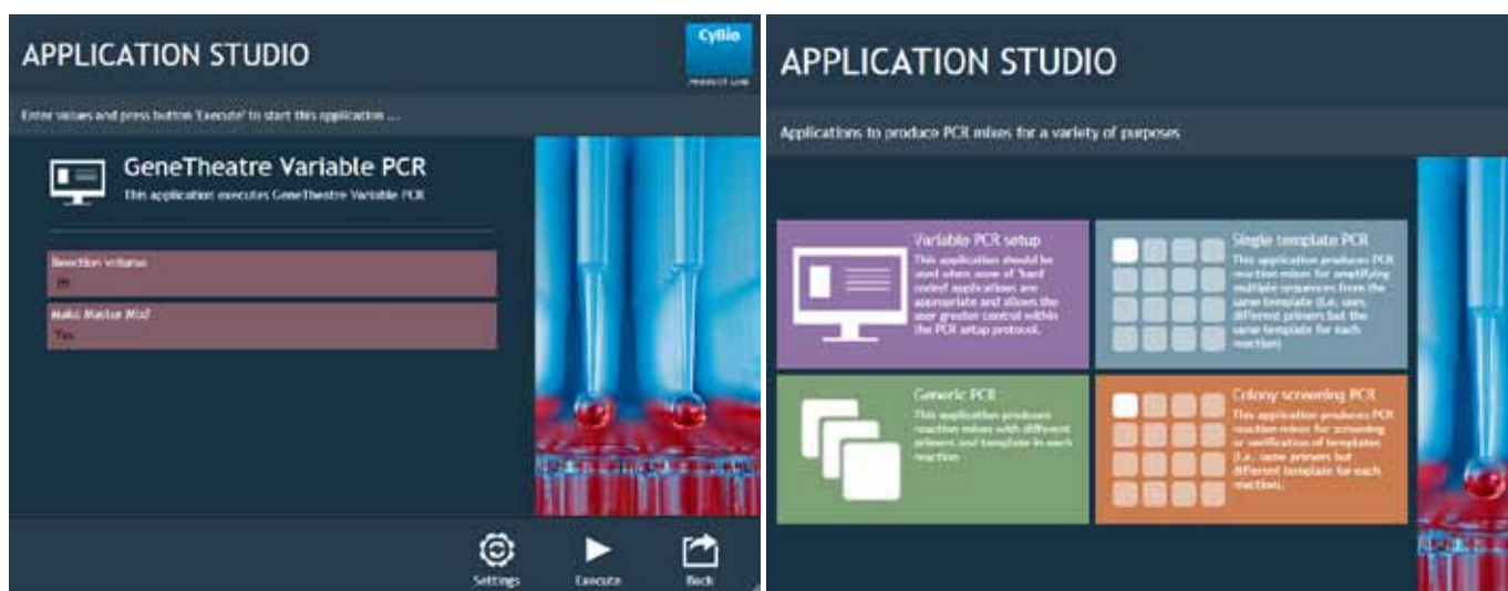
Fig. 1: CyBio® Application Studio front end

The front end is an intuitive touch screen design which is equally useable via mouse and cursor. When launching an application, key information such as reaction volume or sample number can be indicated, avoiding the need for any programming by the user. In addition, the software supplies the user with any necessary information, including how to setup the GeneTheatre instrument including advice on labware and reagents through the use of message boxes and graphics. The reliable and flexible software package underlying the Application Studio enables intelligent error management and can be used to program the GeneTheatre to carry out other liquid handling tasks if desired.