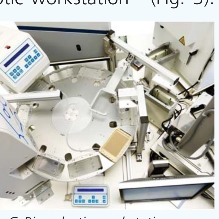
Fig. 3: CyBio robotic workstation (CyBio RWS)