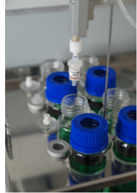
Figure 1: SPE process, which takes place in SPE cartridges