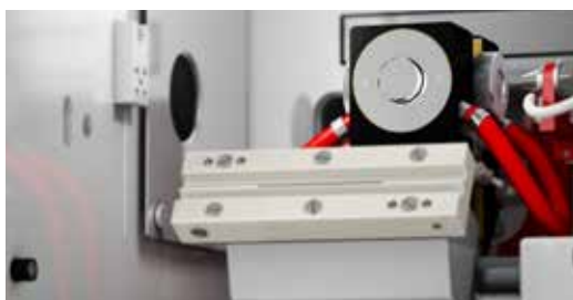
contrAA 800 D with flame and graphite furnace technique in a single sample compartment

The contrAA 800 was developed – by laboratory experts, for laboratory experts – to be as compact and as easy to use as possible. With the dual atomizer concept, both flame and graphite furnace atomization are combined in a compact sample compartment with minimized footprint and maximum performance. The automatic atomizer change and the two-dimensional atomizer alignment allow for flexible and easy handling and facilitate switching between the different atomization techniques.