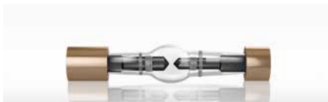
Xenon short arc lamp

The continuum emission spectrum of a xenon short arc lamp covers the complete spectral range of AAS. Lamp-changing for AAS is a matter of the past. Replacement costs compared to HCL instruments are significantly lower, whereas the light intensity is significantly higher than with traditional AAS light sources. It provides an excellent signal-to-noise ratio resulting in improved detection limits. Any element in the applicable spectral range can be analyzed on primary or secondary lines. Along with metals and semi-metals, non-metals like sulfur, phosphorus, fluorine, and halogens can also be determined by evaluating molecule absorption bands, extending the application range of the contrAA 800.