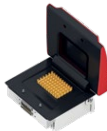
60-well aluminum-block module

For very high reaction volumes in 0.5 ml tubes