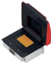
96-well aluminum-block module

For highest demands in speed and uniformity