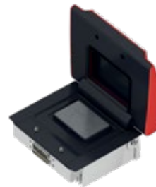
384-well aluminum-block module

For very high reaction volumes in 0.5 ml tubes