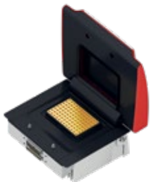
96-well silver-block module

For highest demands in speed and uniformity