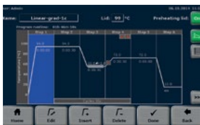
Graphical programming interface

All fields for the input of program parameters are shown in one single screen. One touch leads from the easy spreadsheet to the alternative graphical programming mode.