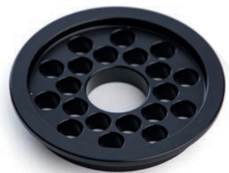
Sample Holder P20