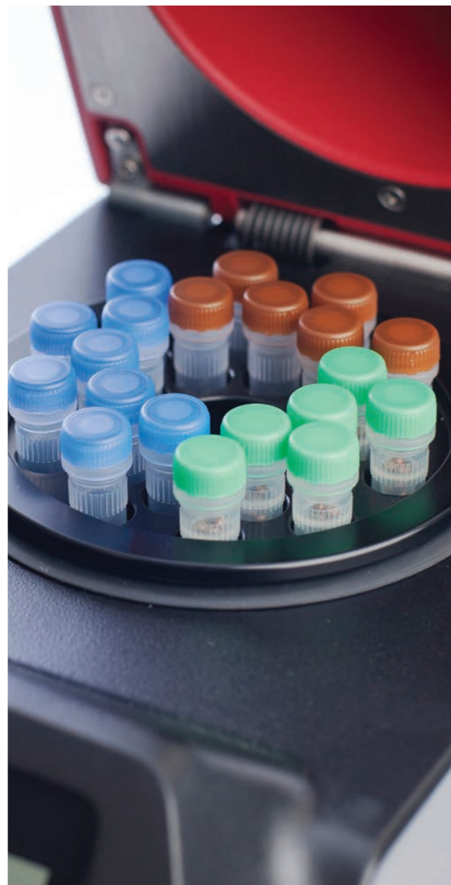
Exchangeable sample adapters enable an easy sample handling.