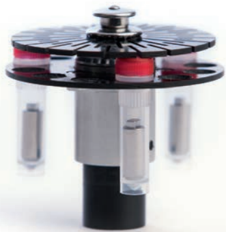
Tube Fixation for the handling of special homogenization such as mandel-based processing.

Various sample holders for several fields of applications: